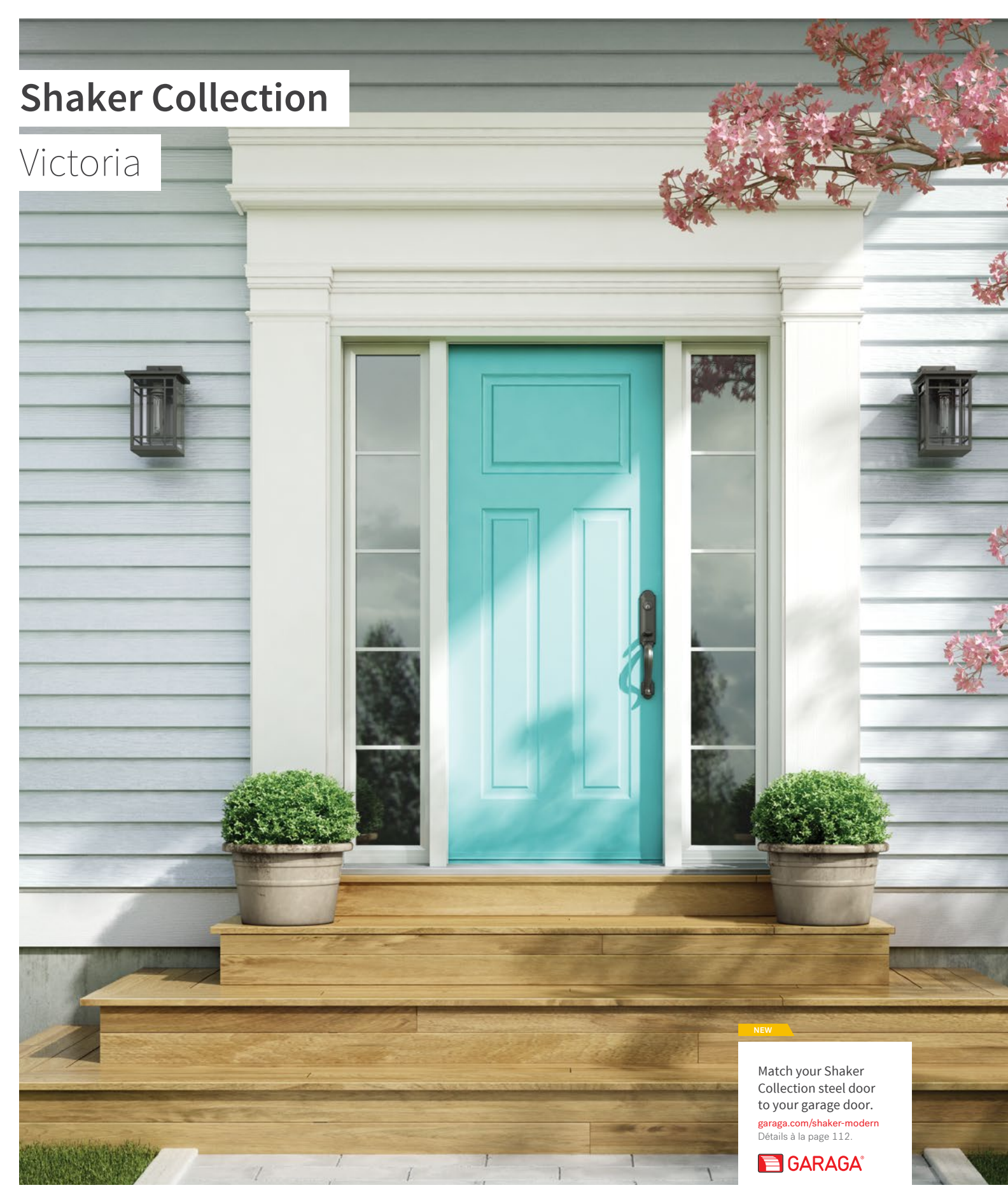
Victoria Shaker steel door p.21. Clear glass sidelites with grill p.109.